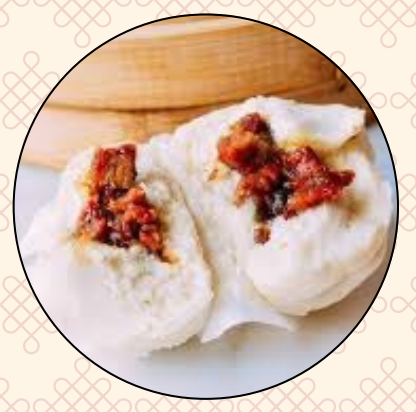
BBQ Pork Bun (3pc) $7.99