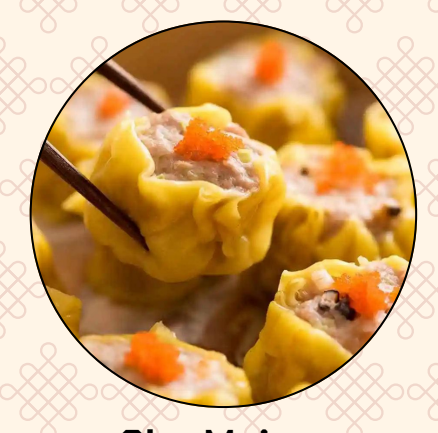
Shu Mai (5pc) $7.99