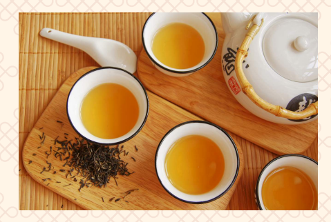
Hot Tea $4.99