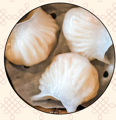
Shrimp Dumpling (6pc) $7.99