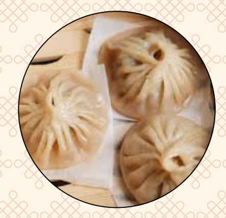
Mini Bun (6pc) $7.99