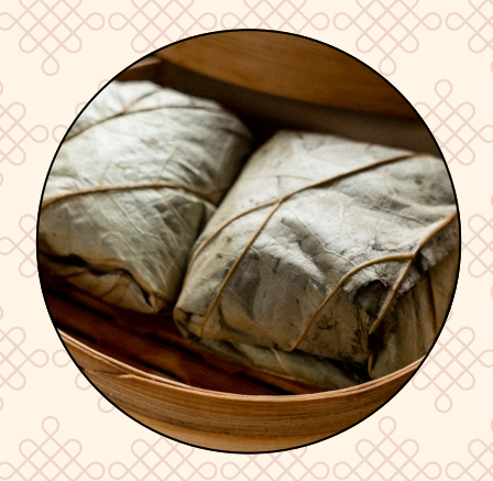
Sweet Rice in Lotus Leaf (2pc) $7.99