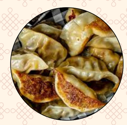
Potsticker (6pc) $8.99